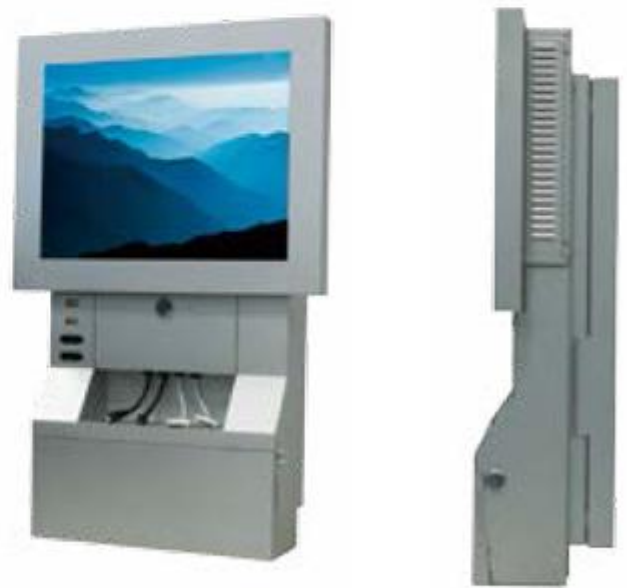
Music Download Kiosk