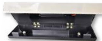
Easy Open Front Door