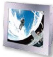
Industrial Panel PC with Small Bezel