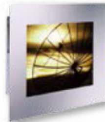
Industrial Panel PC with Big Bezel