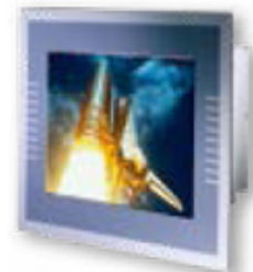
Industrial Panel PC with Aluminum Bezel