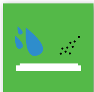
Protected against water and dust