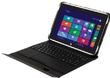
Magnet keeps the screen standing