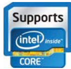
Intel BayTrail-T Quad Core 1, 83Ghz