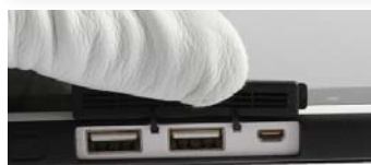
USB and microHDMI

* The technical data are subject to change without notice. ** Optional.