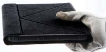
Slim design and light weight