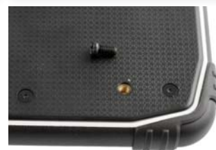
Prepared anchor points