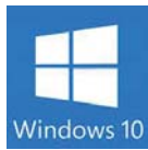
Windows 8® and Windows 10® compatible

The unit is dust- and waterproof according to IP65, and is drop tested for a fall up to 1,2m. Welo R10 is a very affordable rugged tablet PC - very comprehensive, and with reliable functionality.