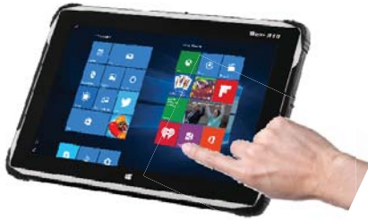
Capacitive multi touch screen