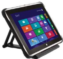
Table holder is available as an accessory