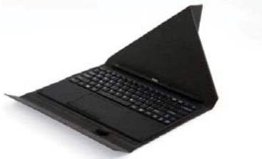
Unique keyboard/cover available as accessory